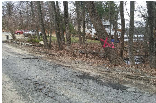
Identified and removed trees for project