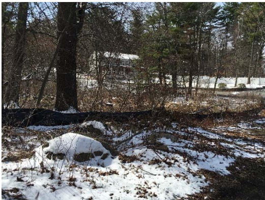
Silt Fence along South Shore Road