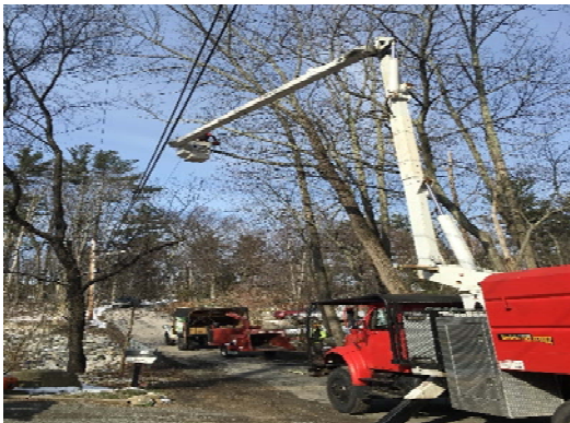
South Shore Road tree work