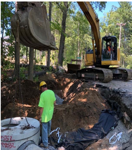
8/10/18-Structure Installment at the Intersection of Zion Hill and Hummingbird Lane.