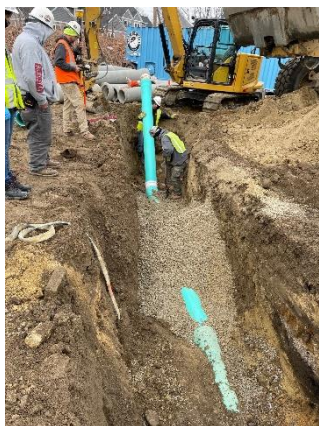
Extension of an existing sewer service.