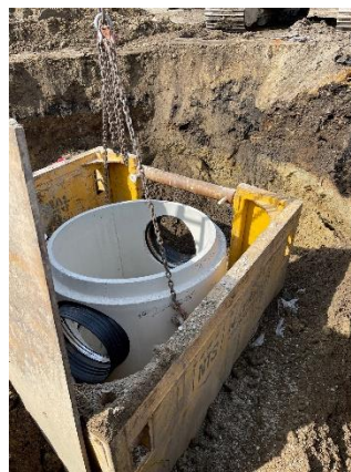
Installing a catch basin within a structure box for safety.