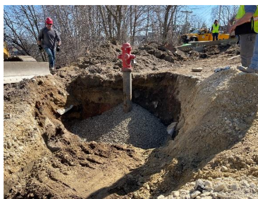
Relocation of an existing hydrant.