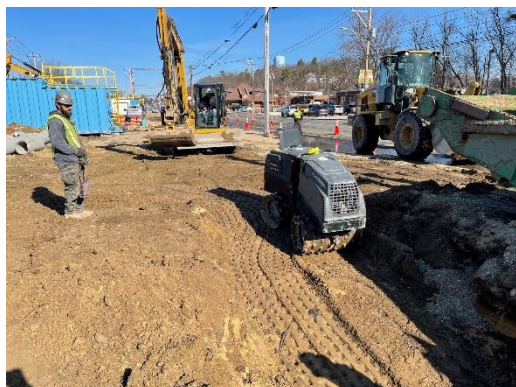
Compacting the trench backfill by remote control.