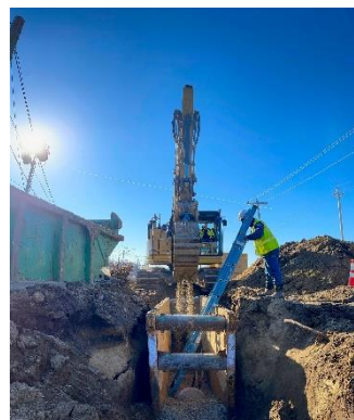
Placing stone bedding for drainage pipe.