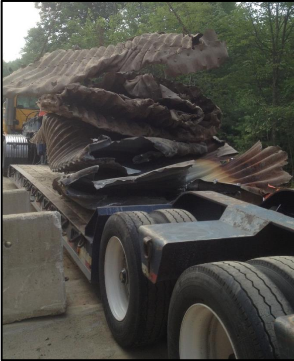
Deteriorated corrugated metal pipe culvert being removed from the site.