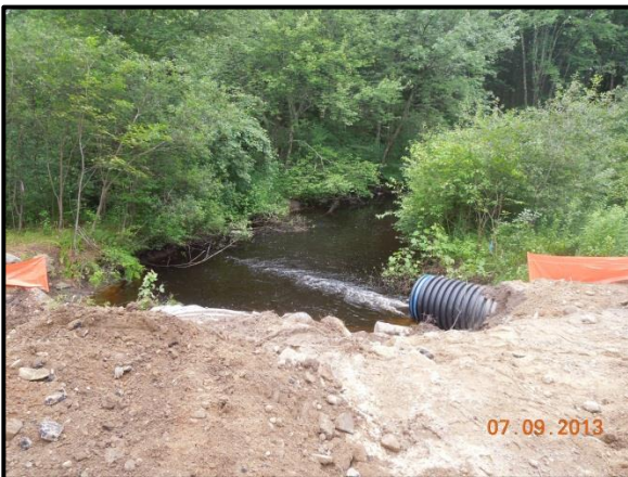
The outlet of the water diversion pipe.