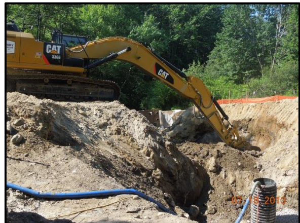
Excavation work continuing to dig down to the proper elevation for the new foundations.