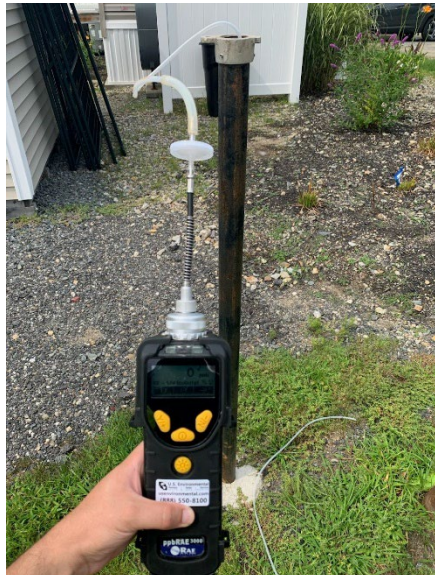
Perimeter vapor well screening.