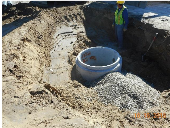
Sewer Manhole Installation