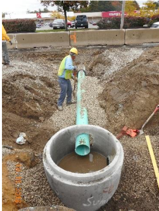
Sewer Service Installation