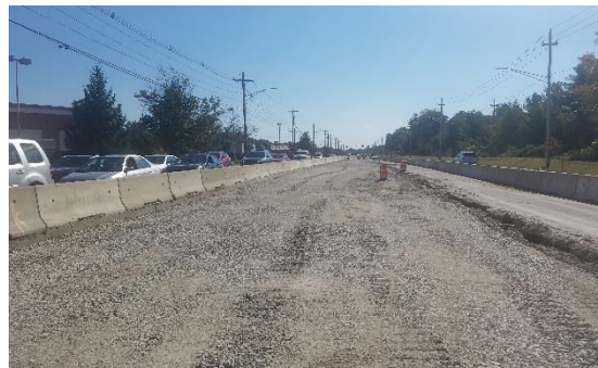
Gravel Placement and Pavement Preparation