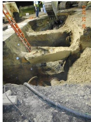
Water Main installation near existing conduit