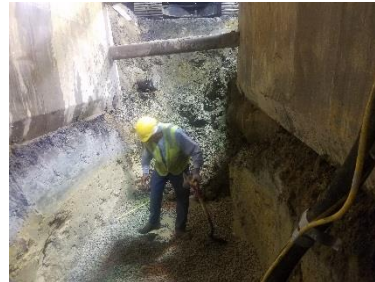
Sewer Installation Near Existing Drain at Depot