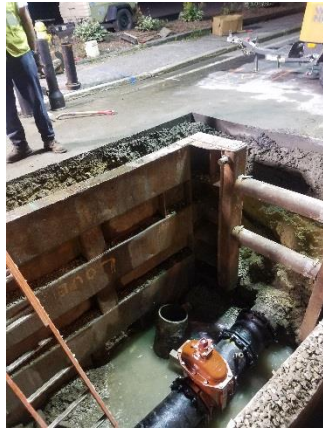
Water Main Installation