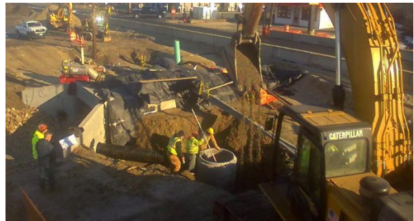
Drainage Structure Installation