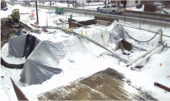
Temperature Control Tent for Curing