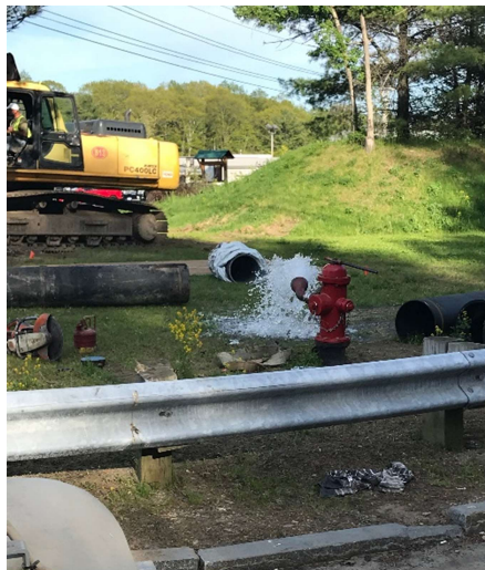
Hydrant Being Fed through Tie-In