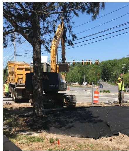
Surface Restoration at Range Road