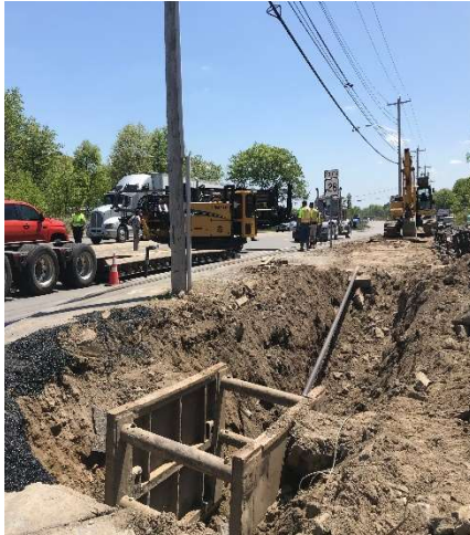
Entrance Pit for Directional Drill at Route 111