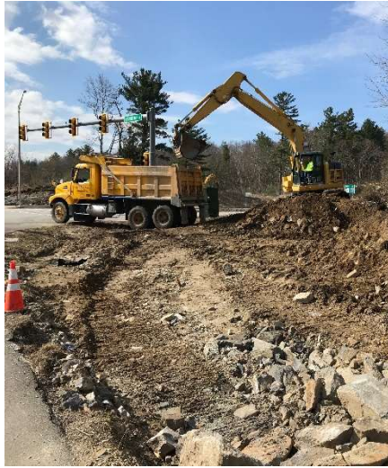
Water Main Re-Alignment at Intersection