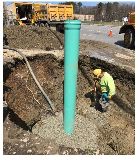
Removing Groundwater from a Trench