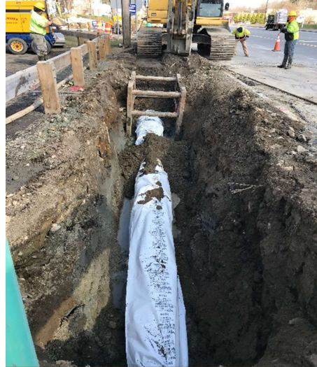
Water Main Installation