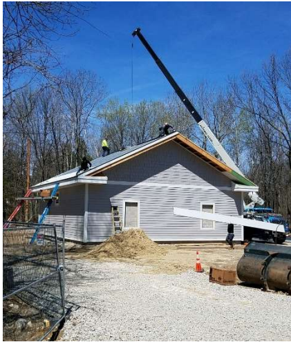
Roofing Work at Northland Road