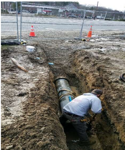
Exterior Piping at Rail Trail