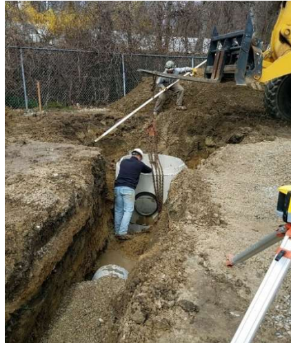
Drainage Pipe Installation at Rail Trail